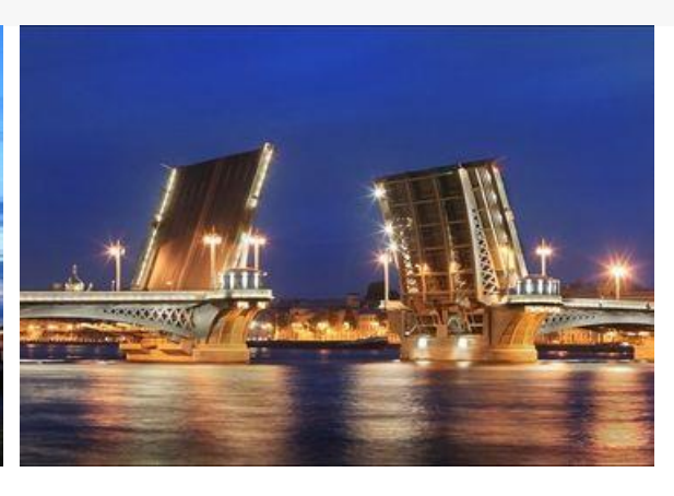
Duration: 2-3 hours from 250 USD

St. Petersburg occupies the first place in Russia and one of the leading places in the world for the number of bridges. The elegance of the draw bridges can be compared only to the beauty of the city architectural ensembles. The bridges of St. Petersburg have become an integral part of the city. Those who walked along St. Petersburg embankments and admired the beauty of drawn bridges fall in love instantly with the individuality of Northern Venice.