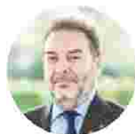
Heart Failure 2019 Scientific Chairperson