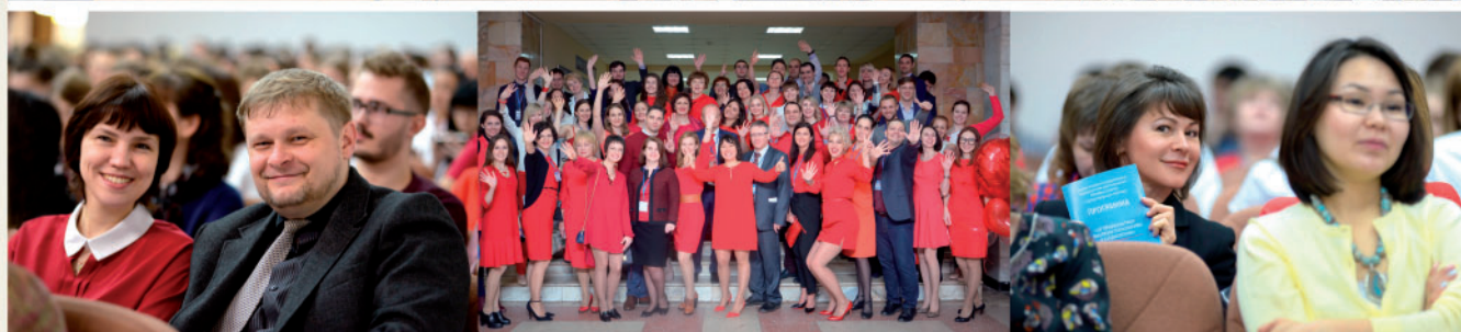
Speakers and participants