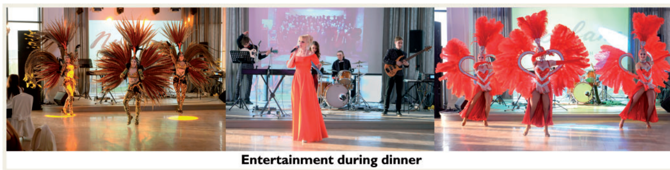
Entertainment during dinner

Importantly, all young researchers I met were cooperative and friendly with many interests in addition to their scientific endeavours. The meeting ended with dinner and entertainment.